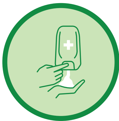
USE HAND SANITIZER