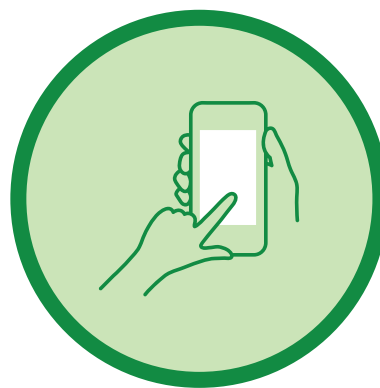
DOWNLOAD COVIDSAFE APP

Visit www.andra.com.au/latest-news/covid-19-information/